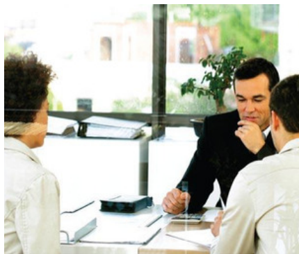
Global Procurement and Planning

In addition, we provide low cost alternatives and second source on key components and can identify and qualify a component for a new product or application.