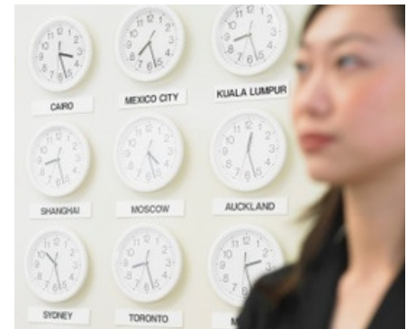
Global Component Procurement