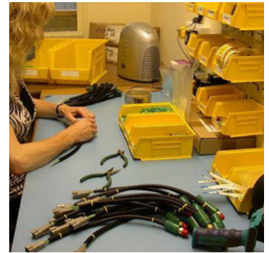
Local Assembly Service

With local deliveries from stock, you can merge your outsourced assembly seamlessly on a Just in Time basis with your core manufacturing process. Furthermore, we'll protect your production schedule from the uncertainties of supply and demand, ensuring the delivery of complete kits, so that you can focus on your core business.