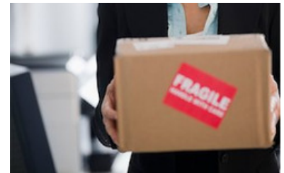
On Time Delivery