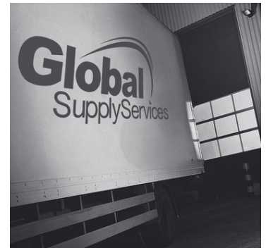
Logistics and Supply