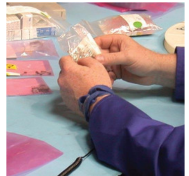
Kitting and Value Added Service