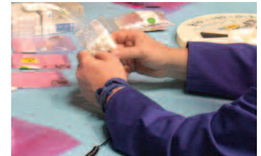
Kitting & Value Add