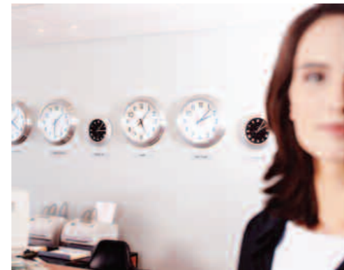
Global Component Procurement

In addition, we provide low cost alternatives and second source on key components and can identify and qualify a component for a new product or application.