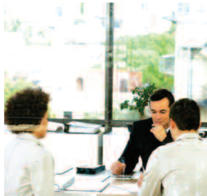
Global Procurement and Planning

Our multi lingual local procurement teams are able to overcome all communication and cultural barriers and focus on developing direct relationships with suppliers. This ensures that they meet their supply obligations, understand the expectations of our customers and adhere to robust Service Level Agreements.