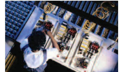
Local Assembly Service

With local deliveries from stock, you can merge your outsourced assembly seamlessly on a Just in Time basis with your core manufacturing process. Furthermore, we'll protect your production schedule from the uncertainties of supply and demand, ensuring the delivery of complete kits, so that you can focus on your core business.