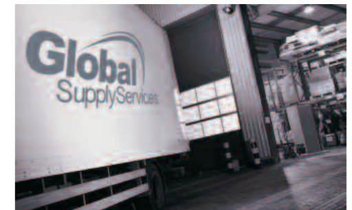
Logistics' and Supply