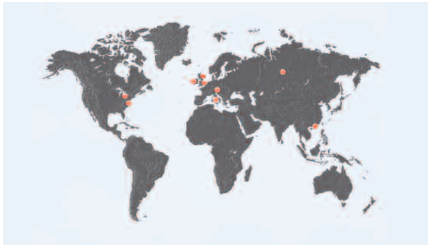
Global Network of Offices