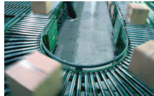
Seamless Replenishment service